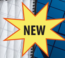
DC AirCube 500